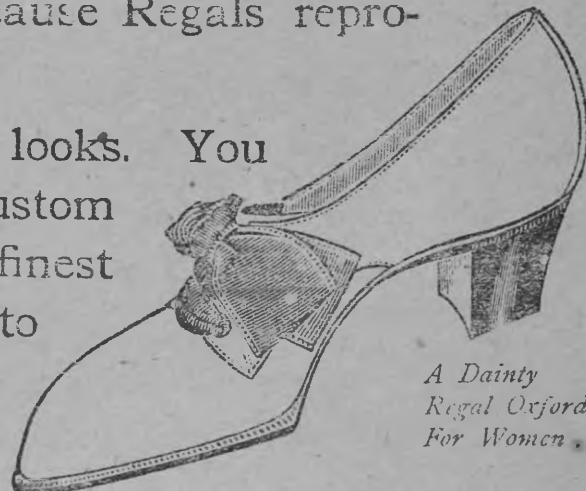
A Dainty Regal Oxford For Women